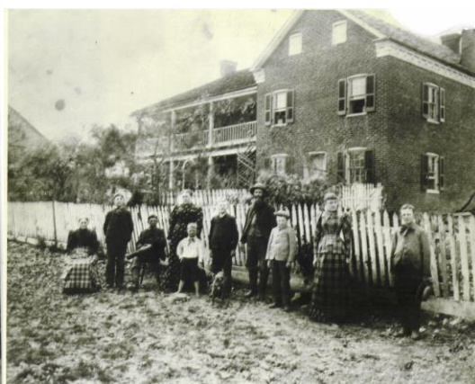
Charlestown, VA he enlisted fighting alongside of his

After the Confederate loss at the battle of Gettysburg he deserted and lived in Martinsburg in what was now West Virginia where on his Draft Registration he was listed as a deserter from the Rebel Army. In 1864 he enlisted in the United States Army with the 3 rd WV Cavalry, serving out the duration of the war until 1865. After the war he was granted a federal pension, with no mention of his former service in the Confederacy.